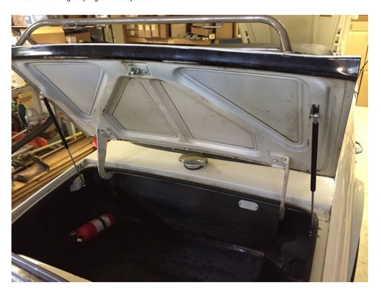
15. Finally, attach the 4 locking springs to the strut end-fittings. These will prevent the struts from detaching if ever they are bumped. Insert the wire fully and then rotate until it snaps onto the end-fitting collar, thus locking the ball stud inside the end-fitting. Some are blind. Start with the top right hand one since it is visible/easiest.

14. Attach the RH gas spring and test operation.