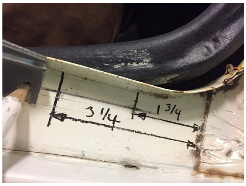
8. Center-punch the two points and drill with a 3/16" bit. Note: Use a tiny drill bit first if you like, to ensure accuracy. It is okay to drill a millimeter closer to the standing edge, but Not okay to drill any farther away, otherwise you will not clear your gasket upon final assembly.

7. Find the proper drill points by using the lower bracket as a template and pressing your pencil INWARD as shown, while dragging the bracket along the standing metal edge.